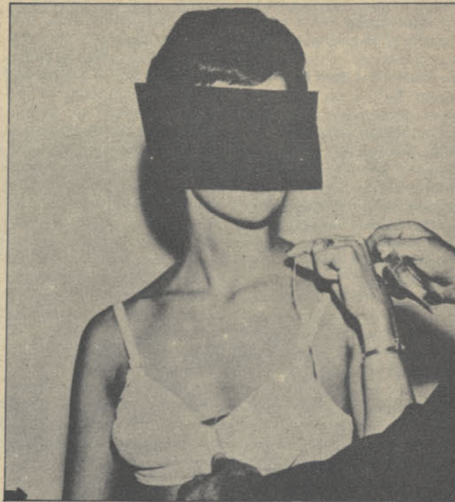
The bra trick: The 'V' of a woman's bra is a good place to hide a mike or special electronic devices.