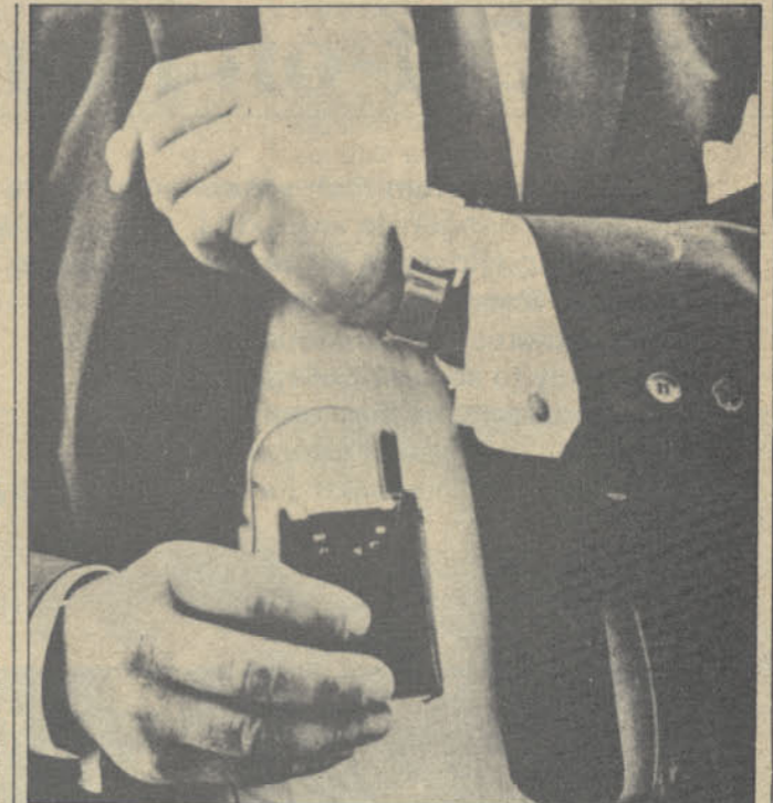
Special devices for personal protection.